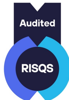
RISQS Scheme Manager

A handwritten signature in black ink, appearing to read 'R. S. S. S.' with a large flourish above the first letter.